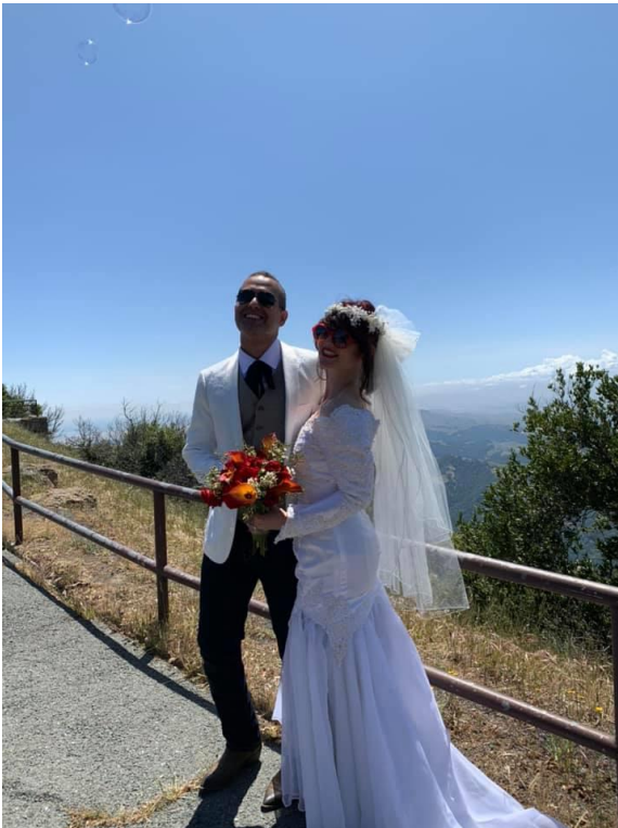
Figure 2 Newly Married Couple on Mount Diablo.