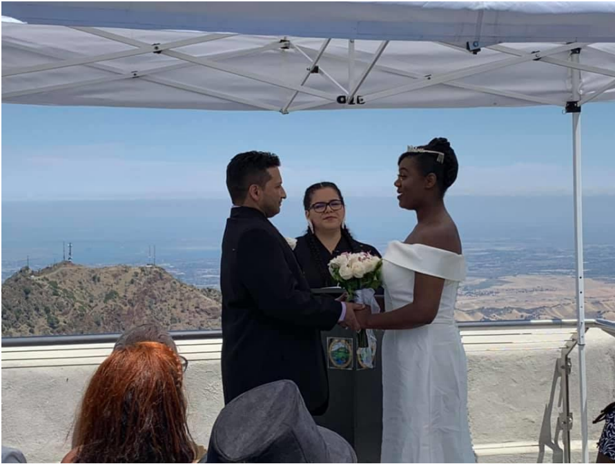
Figure 1 Couple getting married on Mount Diablo with views of surrounding areas.